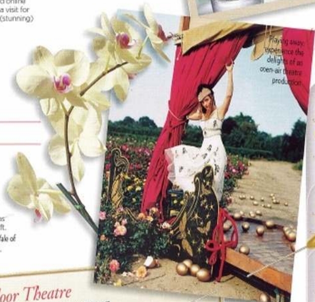
Playing easy, experience the delights of an open-air theatre production.