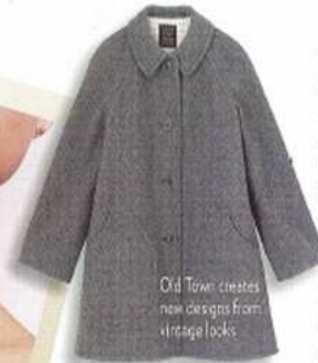
Old Town creates new designs from vintage looks