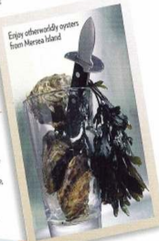
Enjoy otherworldly oysters from Mersea Island

129 Coast Road, West Mersea, Essex CO5 8PA. Tel: 01206 382700